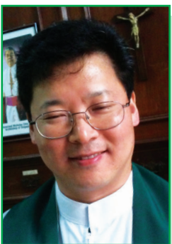
Welcome Father Definitor -

QUIETING THE SOUL, MARANATHA - A 5-day silent retreat will be held from 6-12 Sep 2010 at the cool pine-forest environment of Kuala Lumpur, Malaysia. Retreat is limited to 12 participants only. Contact Cenacle Sisters at 6565 2895, 9722 3148, or email cenaclesisters@yahoo.com.sg . Deadline for application: 15 Aug '10.