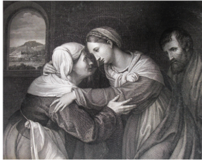
BOWYER BIBLE VOLUME 34 PRINT 4653 THE VISITATION, LUKE 1:29-40 ALESSANDRO BONVICINO (IL MORETTO)