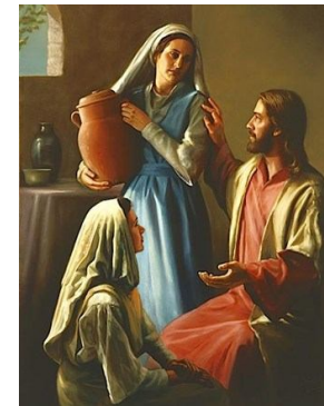
MARY AND MARTHA

Day 12 Day 12 Day 12 Day 12 Day 12 Day 12 Day 12 Day 12 Day 12 John 11:1-14, 12:1-8